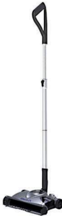
Figure 4: Gtech SW02 cordless floor cleaner