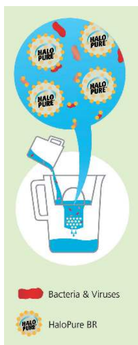
Figure 2: HaloPure – how it works