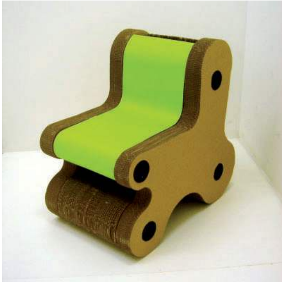
Figure 5: SPLAT Child’s chair