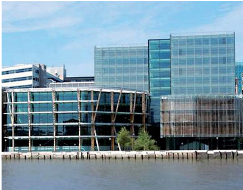
Figure 1: Nomura’s London Headquarters

[Source: ©Nomura/Fletcher Priest Architects. Used with permission.]